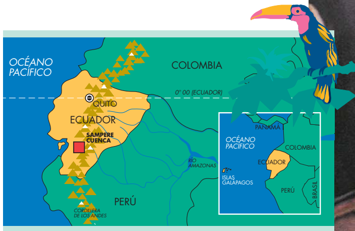
Mapa de Ecuador